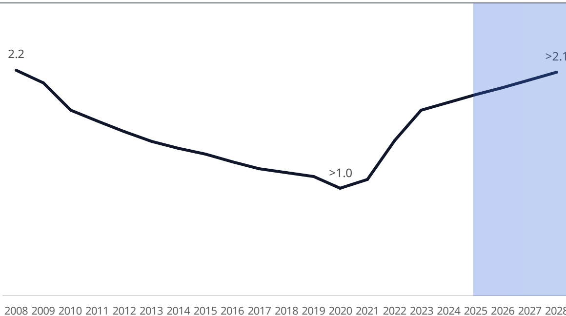
Default rates for B2B and B2C, in %